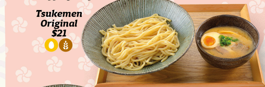
Tsukemen Original $21