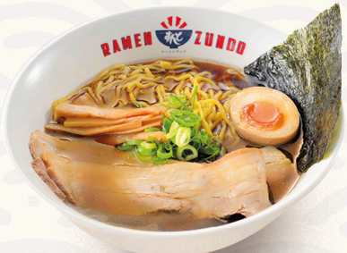
Soy $19.50 Chicken & Pork Broth Soy Sauce Base