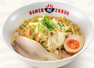
Miso $21 Chicken & Pork Broth with Soy Bean Paste