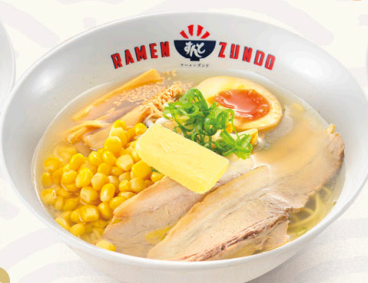
BUTTER CORN: Shio $22 Miso $23.50 Chicken & Pork Broth