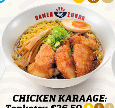
CHICKEN KARAAGE: Tonkotsu $26.50 Shio / Soy $26 Miso $28 Deep Fried Chicken (Thigh Fillet)