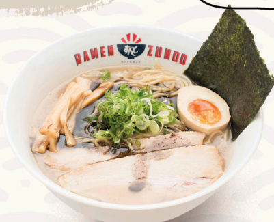
Tonkotsu Black $21 Pork Broth Roasted Garlic Oil