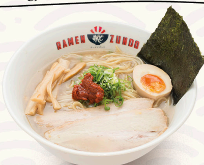
Tonkotsu Red $21 Pork Broth Chilli Paste