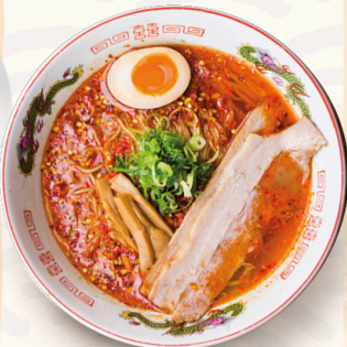
Red Hot Ramen $20.50 Chicken & Pork Broth Salt Base