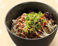
Small Pork Chashu Rice $7 (Order alone $8.50)

Your Favourite main dish + small rice dish