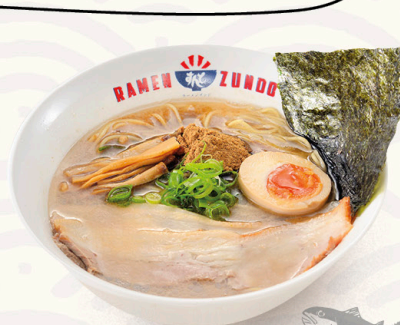
Gyokai Tonkotsu $21.50 Pork Broth Dried Bonito Blend