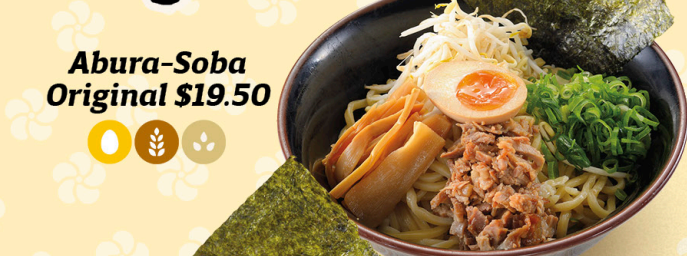
Abura-Soba Original $19.50