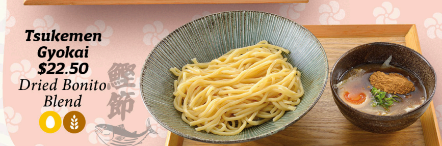
Tsukemen Gyokai $22.50 Dried Bonito Blend