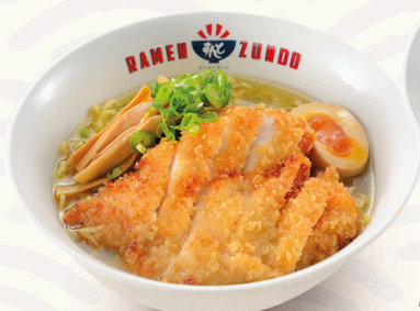
CHICKEN KATSU: Tonkotsu $26.50 Shio / Soy $26 Miso $28 Chicken Schnitzel (Breast Fillet)