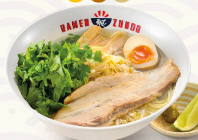
Yuzu Shio Coriander $24 Chicken & Pork Broth Yuzu Citrus