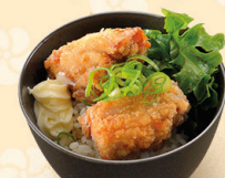
Small Karaage Rice $7 (Order alone $8.50)