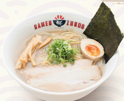
Tonkotsu Original $20 Pork Broth

Traces of these allergens may be contained in food that does not show the allergen indicator in its description. Ramen Zundo takes the utmost care in food handling, but please, proceed with caution when affected by a severe allergy.