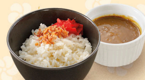
Small Curry Rice $7 (Order alone $8.50)