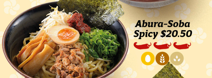
Abura-Soba Spicy $20.50