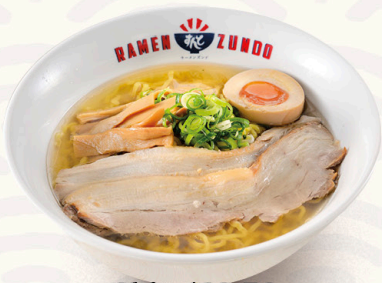
Shio $19.50 Chicken & Pork Broth Salt Base