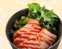
Small Teriyaki Salmon Rice $7 (Order alone $8.50)