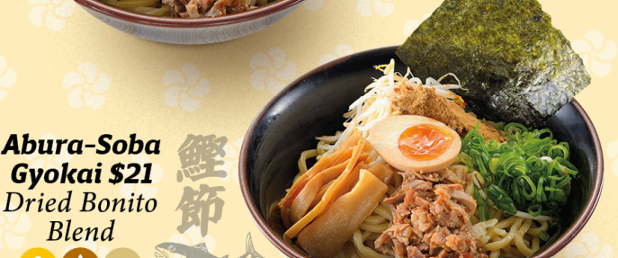
Abura-Soba Gyokai $21 Dried Bonito Blend